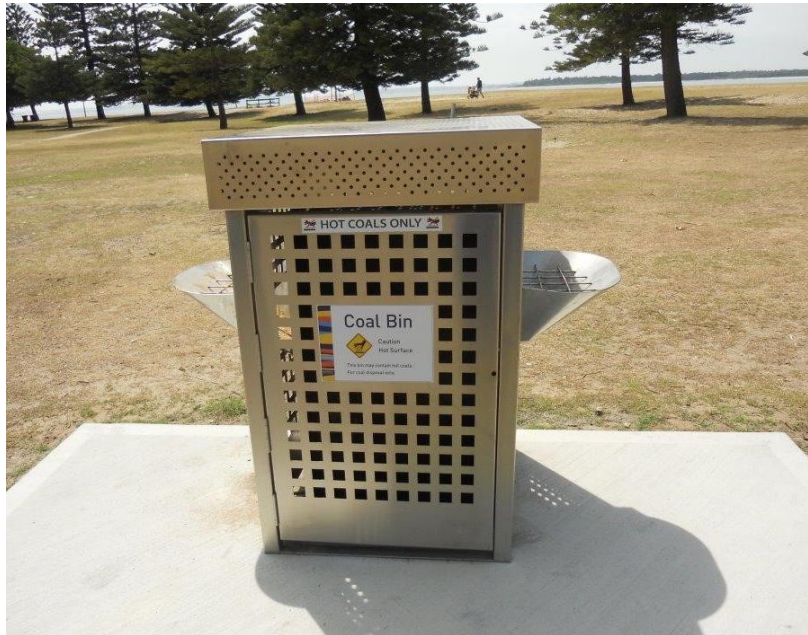
Shown with client's custom signage option

For the disposal of hot charcoal bricks in parks and public venues.